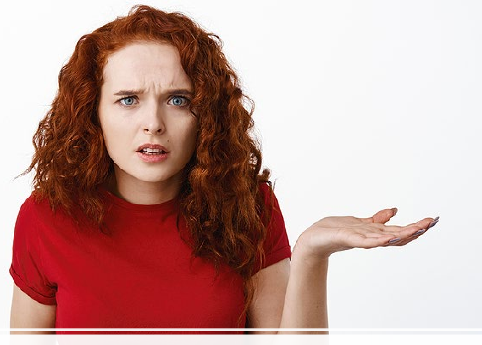
So whats all this Heat Pump stuff about then